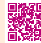
Add Download App 下載應用程式