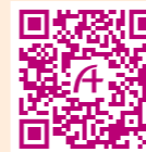
Service Information 服務詳情

40 Stubbs Road, Hong Kong 香港司徒拔道40號 (852) 2835 0651 haemo@hkah.org.hk